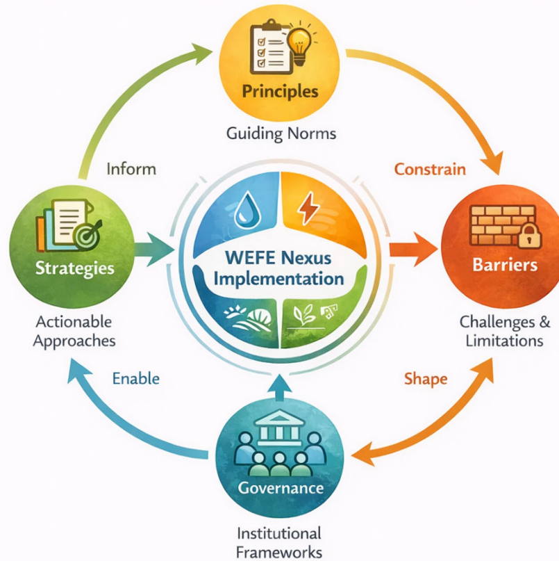
Fig. 4 Interactions on the way to the WEF Nexus implementation

institutional translation into national policy. Thus, it may not surprise that fragmented policy regimes and siloed institutional arrangements persist across most non-EU PRIMA countries. Horizontal and vertical governance misalignments impede policy implementation. Cross-sectoral coordination remains largely ad hoc, constrained by weak or unclear mandates, insufficient funding, and a lack of institutional incentives for collaboration (Lalawmpuii and Rai 2023; Leck et al. 2015; Lucca et al. 2023; van Gevelt 2020). Consequently, public agencies of water, agriculture, energy, and environment often pursue conflicting objectives, while national development strategies rarely acknowledge interdependencies across sectors (Urbinatti et al. 2020; Zhang et al. 2019). The result is poor alignment and trade-off blind policymaking. These structural deficits are exacerbated by the limited adoption of integrated assessment models, e.g., the Climate, Land, Energy, and Water Systems (CLEWs) framework (Ramos et al. 2022), and weak science-policy interfaces (Herrera-Franco et al. 2023; Lawford 2019; Liu et al. 2018).